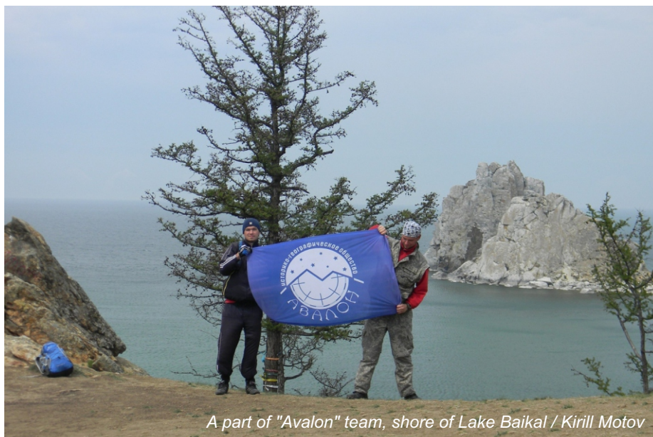
A part of "Avalon" team, shore of Lake Baikal

Throughout the year 2016, we hosted Traveller's club nine times. It was held in the Karaganda branch of "The OFFICE Nargilia Lounge", a place famous for its water pipes. Several Avalonians, who participated in the trekking journey in the Nepalese Langtang, "Ulytau-Aral"