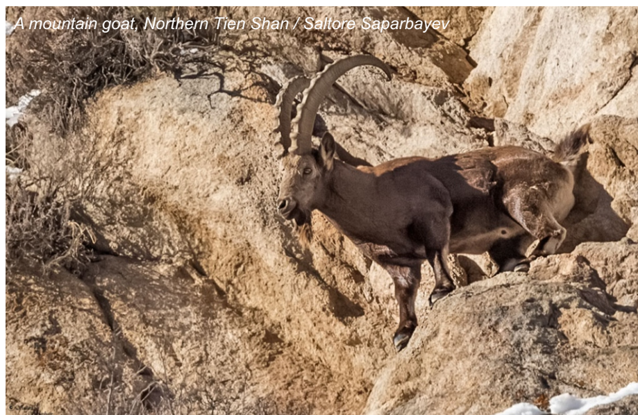
A mountain goat, Northern Tien Shan