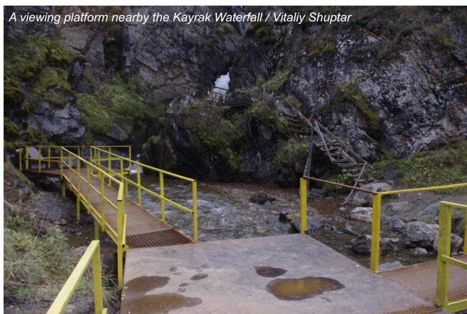
A viewing platform nearby the Kayrak Waterfall

Because of our failure to finish the construction works, we had to postpone the media trip for the representatives of mass media outlets and travel companies until next year. Within this media trip we are planning to present the infrastructure, which we have created at the territory of the national park, and demonstrate the potential of its unknown corners to the wide audience.