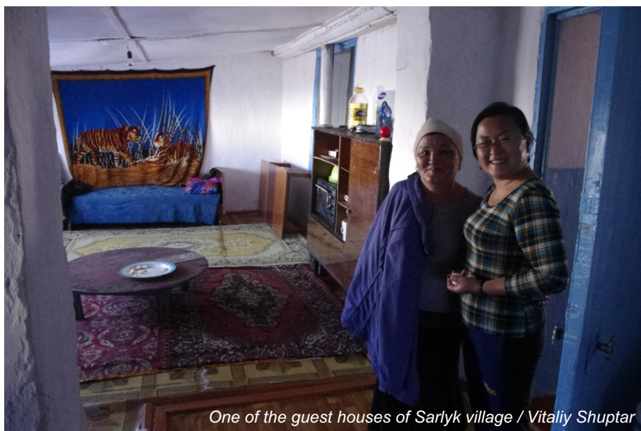
One of the guest houses of Sarlyk village