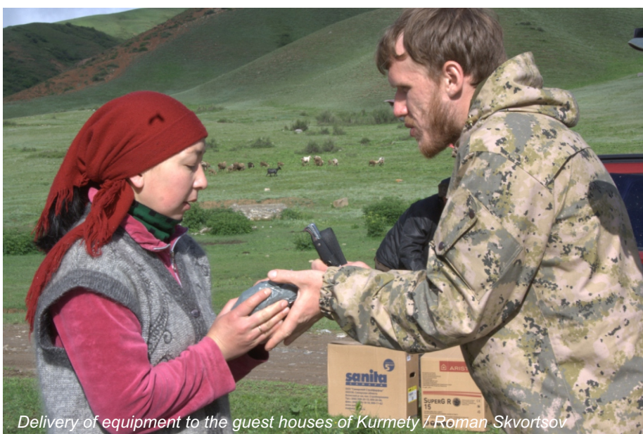
Delivery of equipment to the guest houses of Kurmety

Although the reconstruction of ranger cabins is still a debatable issue (as it has been explained earlier, the agreement with the national park on this matter has not been signed yet), our works on developing nature trails in the park have been approved, at least on paper (and with some reservations). Nevertheless, bureaucratic obstacles have been holding up the progress of our work with "Kolsai Kol-