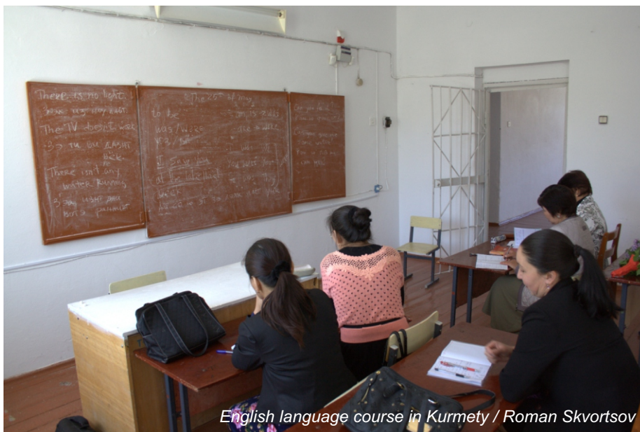
English language course in Kurmety / Roman Skvortsov

In spring, in the framework of the project, we also carried out a socio-economical study in Kurmety village. For this study, we conducted polls and interviews with the local residents participating in the project