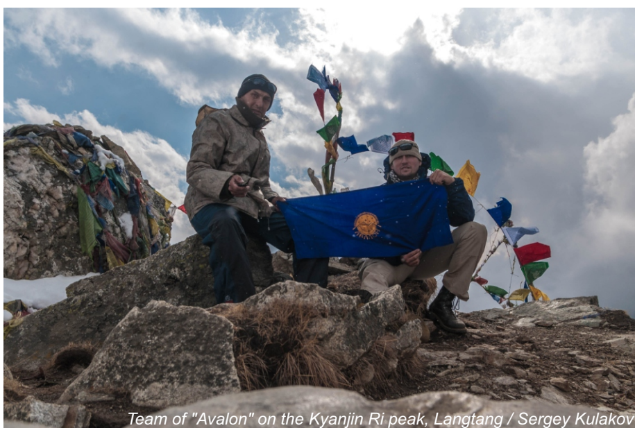
Team of "Avalon" on the Kyanjin Ri peak, Langtang