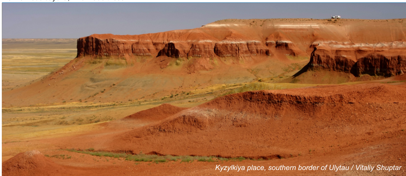
Kyzylkiya place, southern border of Ulytau / Vitaliy Shuptar

We would like to remind you one more time that "Avalon" is not just all about trips and expeditions, it also encompasses a range of other activities and interesting projects. For implementing all these projects we often need volunteers and paid employees, and are always pleased to see the members of "Avalon" HGS among them. Therefore, if you think you have some skills, which could be useful for "Avalon", we will be happy to find out about it.