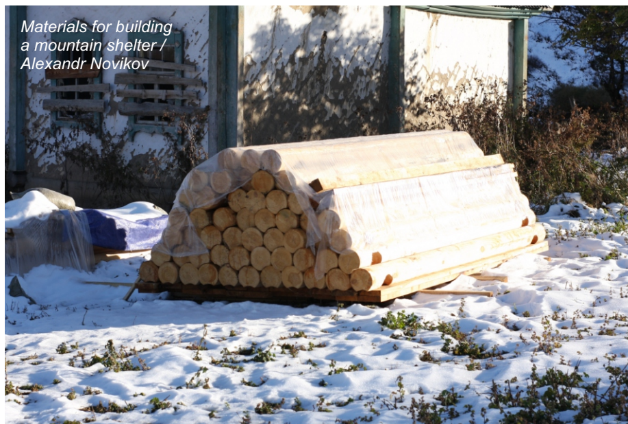
Materials for building a mountain shelter / Alexandr Novikov

deri" SNNP since May 2016. It was in May that our first team of volunteers arrived on site, ready to work. However, instead of developing nature trails, our guys were forced to additionally redevelop some of the routes, as the national park administration did not agree with our viewpoint. It was finally decided that the nature trail from Kurmety village to Kyzemshek peak via Taldy gorge would go through a different, less convenient route (that is unless we succeed in convincing the national park administration that the areas, where limited economic activity is permitted, are also suitable for nature trails).