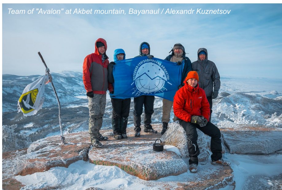
Team of "Avalon" at Akbet mountain, Bayanaul

It is noteworthy that in the past year we once again floated down the Irtysh with our friends from PavGeo. This time our floating trip was longer than last year and lasted 4 days. It started in Akku village and finished at the Pavlodar riverside at the Day of