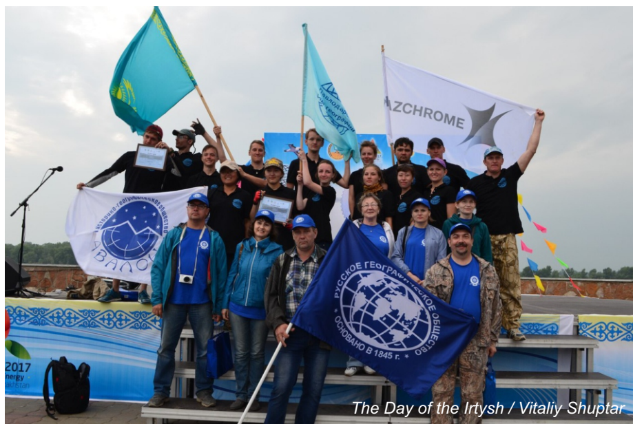
The Day of the Irtysh / Vitaliy Shuptar

time owing to circumstances beyond our control. Some difficulties in the completion of the both maps mentioned above were caused by Google Maps system (both projects envisage the creation of printed maps, as well as the enrichment of this cartographic system with the respective information). At present, Google Maps undergo some major changes: by March 2017 Google Map Maker will cease to exist and in future one will be able to accomplish such tasks (or similar ones) by means of Google Maps. Until then, adding new objects to maps presents some difficulties and becomes increasingly problematic with each passing day.