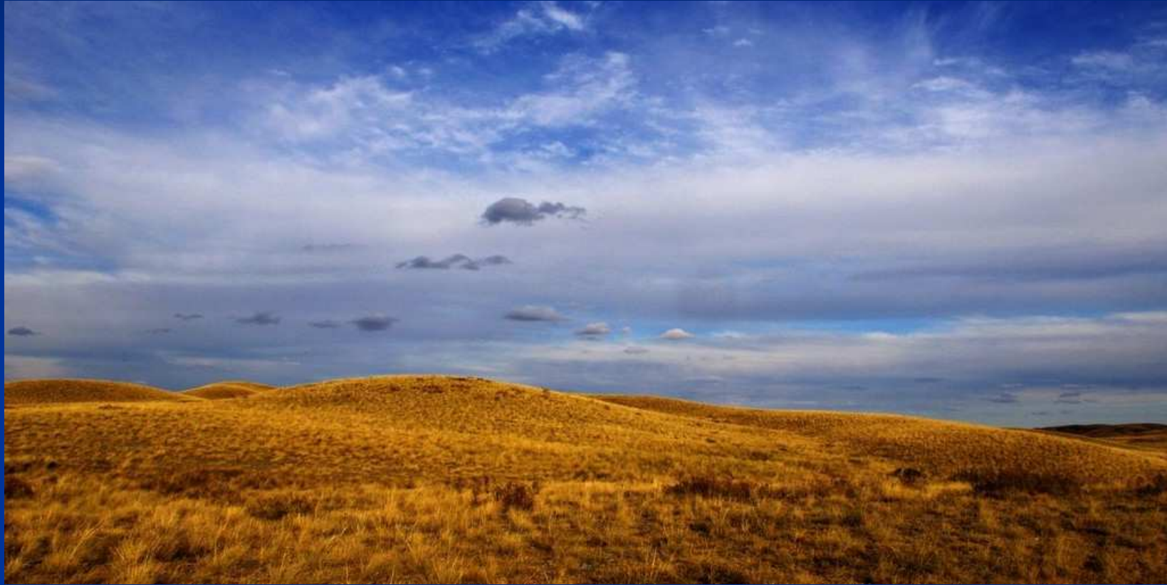
Typical steppe landscape of Central Kazakhstan